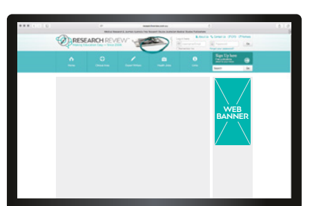
WEBSITE BANNER 170px(W) x 315px(H) @ 72dpi