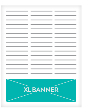
XL BANNER STRIP (NO BLEED) 190mm(W) x 67mm(H)