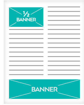
BANNER STRIP (NO BLEED) 190mm(W) x 52mm(H)